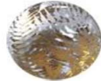
Civic square sculpture by Neil Dawson

A walk visiting some of Wellington's Peace heritage treasures: Sculptures, memorials, trees and historic sites dedicated to peace, tolerance and understanding.